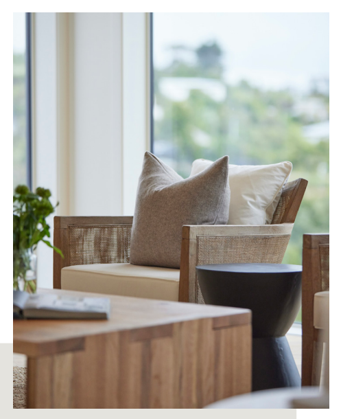
"We don't do cookie cutter staging. Our focus is on creating a bespoke, warm and inviting experience for potential buyers."